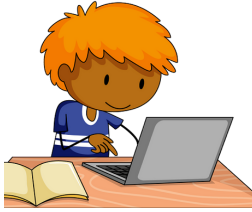
Computer or tablet