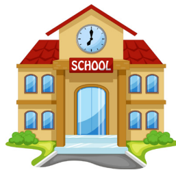
Being in school