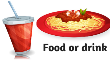
Food or drink