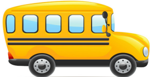
Car or bus rides